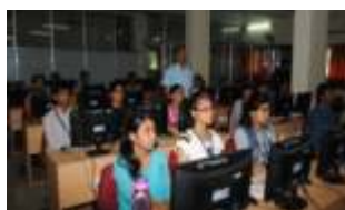
Workshop on PLC

The intensive training is to prepare our students to begin a lifetime of professional creativity and leadership. We have a focused approach for the all-round personality development of the students by organizing guest lecturers by Industry experts, seminars and industrial visits so that students get required industry exposure to the latest developments in the field. The department also enjoys very close relationships with industry, both in terms of research and recruiting. Time to time various sponsored project and workshops are organised to explore the latest technologies.