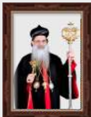
H. H. Baselios Marthoma Paulose II Catholicos of The East & Malankara Metropolitan The Supreme Head of The Malankara Orthodox Church